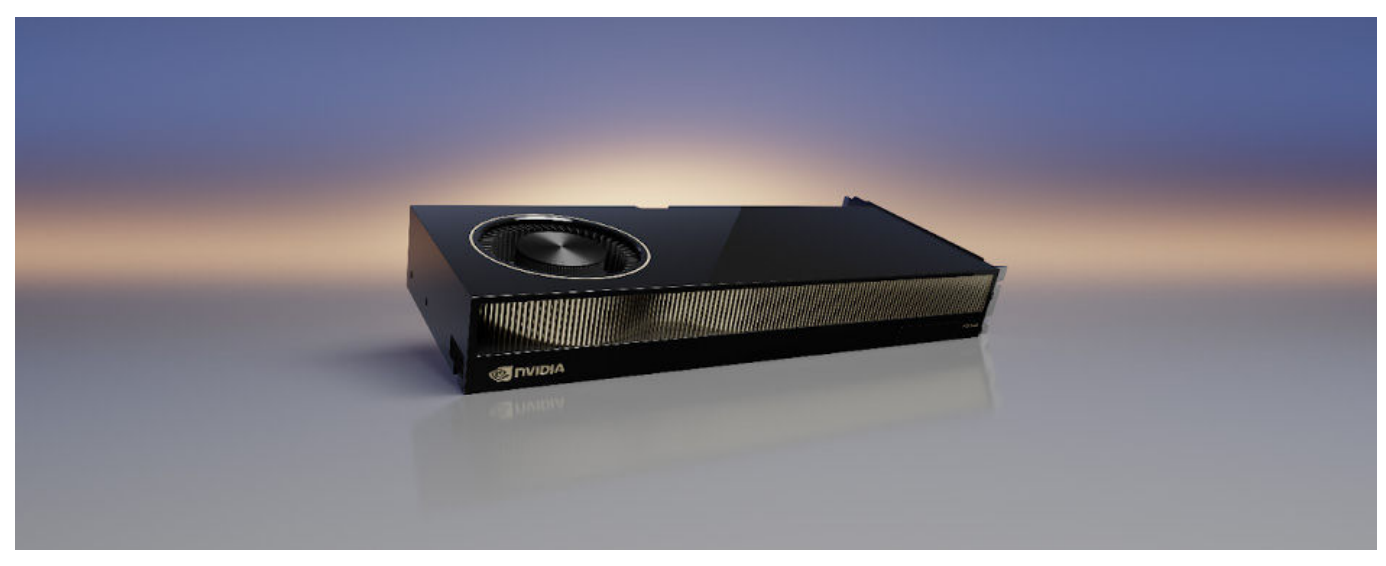
NVIDIA RTX 6000 Ada Generation GPU