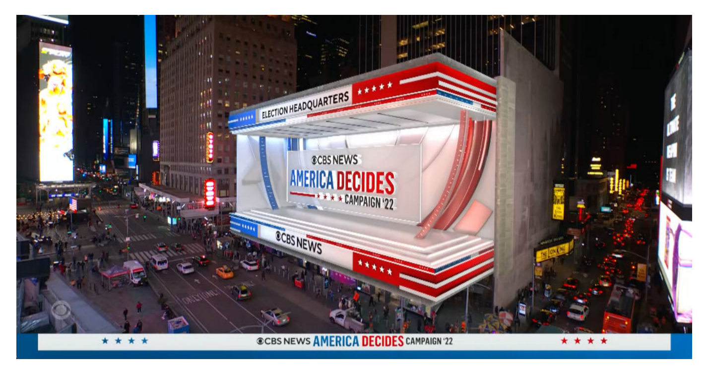
An example of Viz Engine 5's physically-based rendering and global illumination techniques.