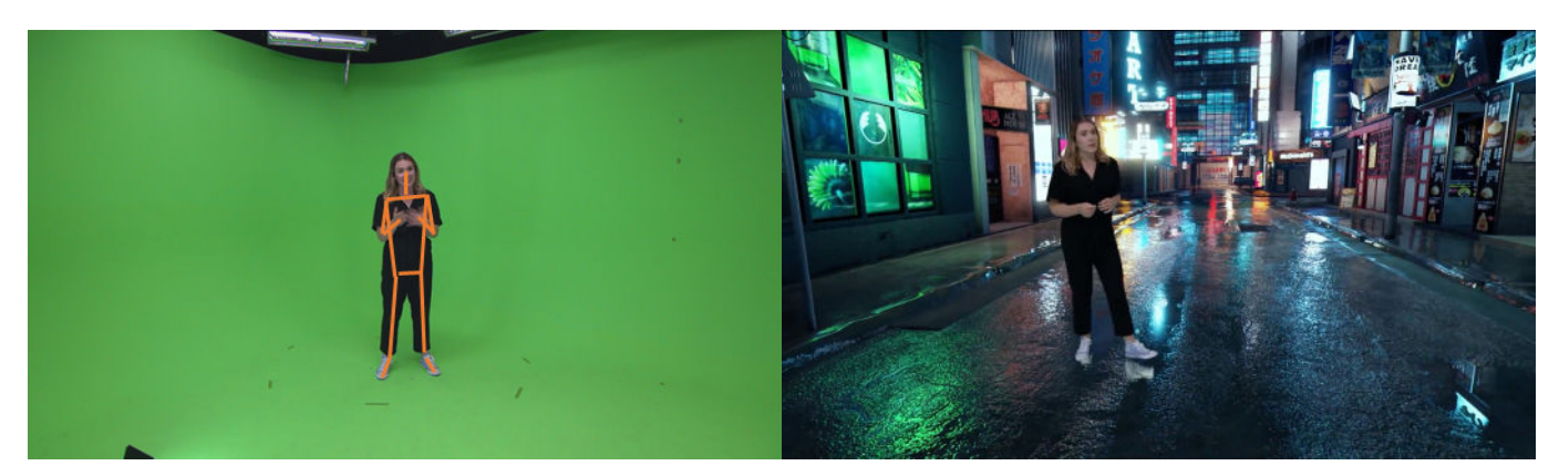
Al-based real-time pose estimation enables realistic talent reflections and shadow casting, produced by Reality Connect™, natively in Viz Engine 5.